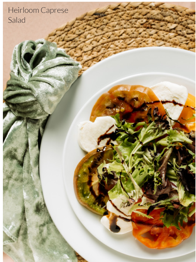
Heirloom Caprese Salad