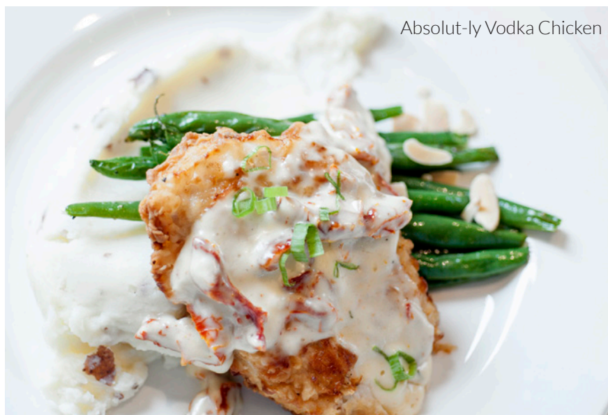
Absolut-ly Vodka Chicken

Lightly breaded chicken breast with capers and zucchini in a light lemon cream sauce. $33 Plated/$32 Family style/ $28 Buffet