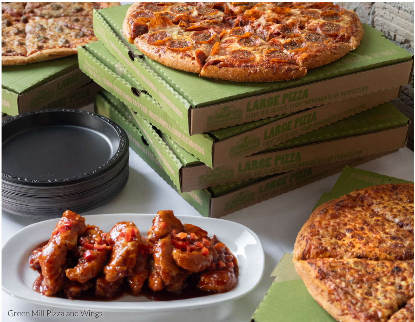
Green Mill Pizza and Wings