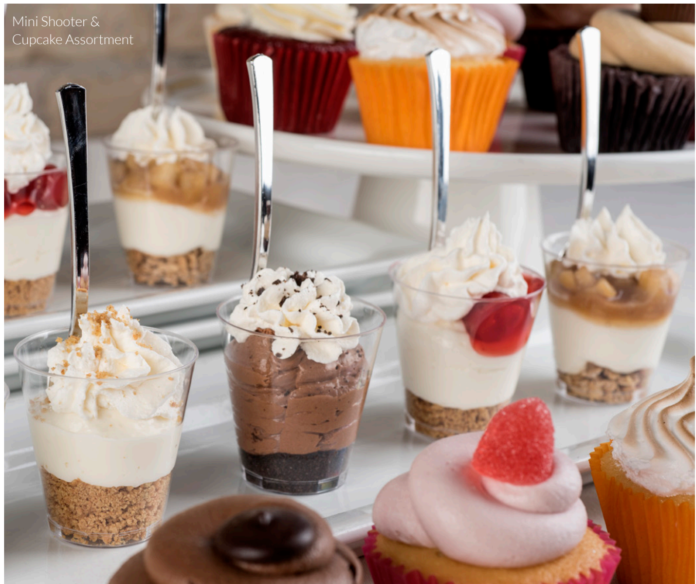
Mini Shooter & Cupcake Assortment

G Denotes Gluten Friendly. Why do we call it Gluten Friendly? The indicated items are gluten free, but because we use high-gluten flour in our kitchen, there is a chance of cross-contamination on all items. We cannot guarantee that items are 100% gluten free. Consuming raw or undercooked meats, poultry, seafood, shellfish, or eggs may increase your risk of food borne illness especially if you have medical conditions. Items and pricing subject to change. Requires 48 hours notice.