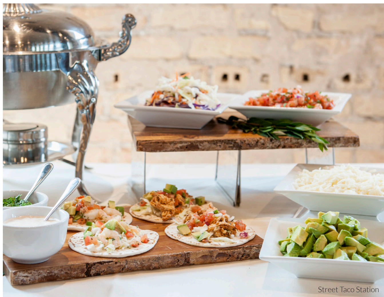
Street Taco Station