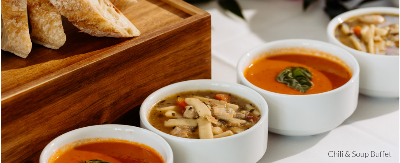
Chili & Soup Buffet